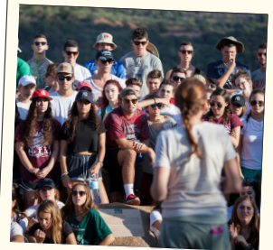
year Course 23

"Year Course was the best year of my life. I dramatically improved my Hebrew and had the opportunity to visit many historical sites that I had only read about before. I met some of my best friends who I talk to on a regular basis. I had the opportunity to volunteer with MDA which was the most fulfilling volunteer work I have done. Year course is an unbelievable experience, I recommend it to everyone. "