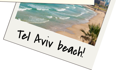
Tel Aviv beach!